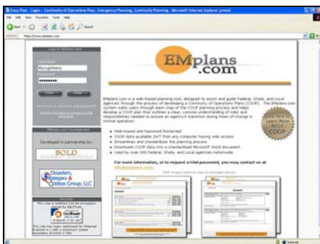
Web-based / Password Protected