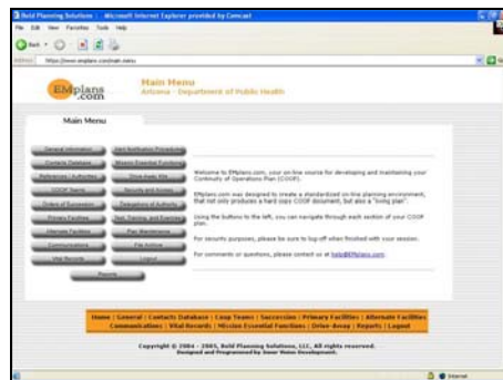
Easy-to-use Menu Layout